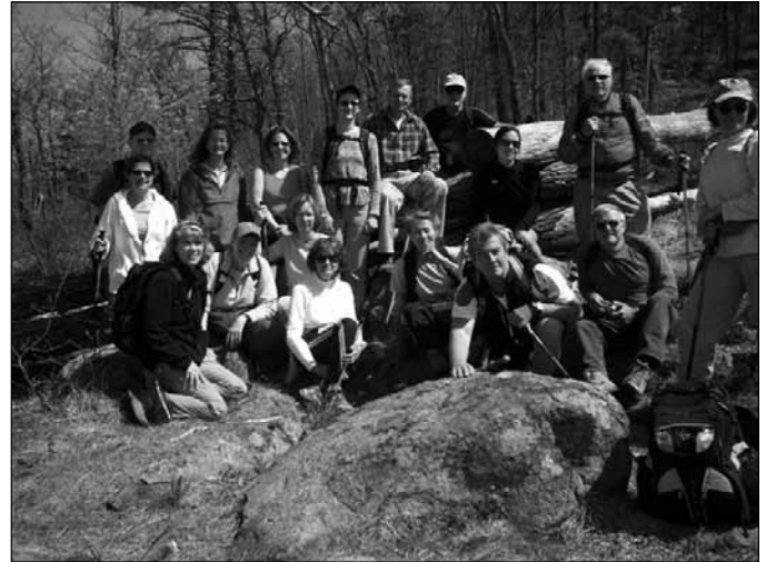
FRENCH MOUNTAIN, APRIL 21 — The group that took part in the Mo-Rodd Midweek Adventure on April 21 is seen on French Mountain. Complete review is below.