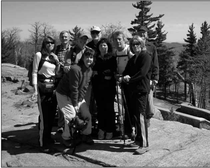
PROSPECT MOUNTAIN, APRIL 14 — The group that took part in the Mo-Rodd Midweek Adventure on April 14 is seen on Prospect Mountain. Complete review is below.