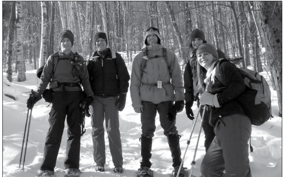
FIRE TOWER & GRUB — A Young Members Group outing on Hadley Mountain. Please see trip review on page 17.