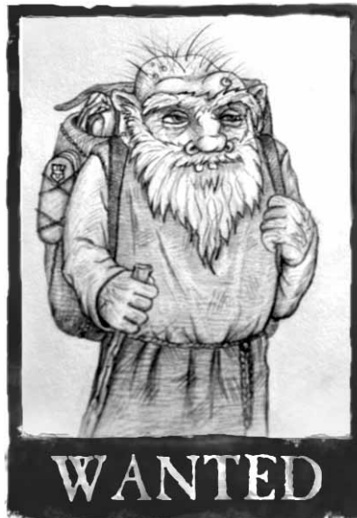
Artwork by Melissa Symolon

Detailed instructions are located on the Treasure Hunt page of the GF-S website.