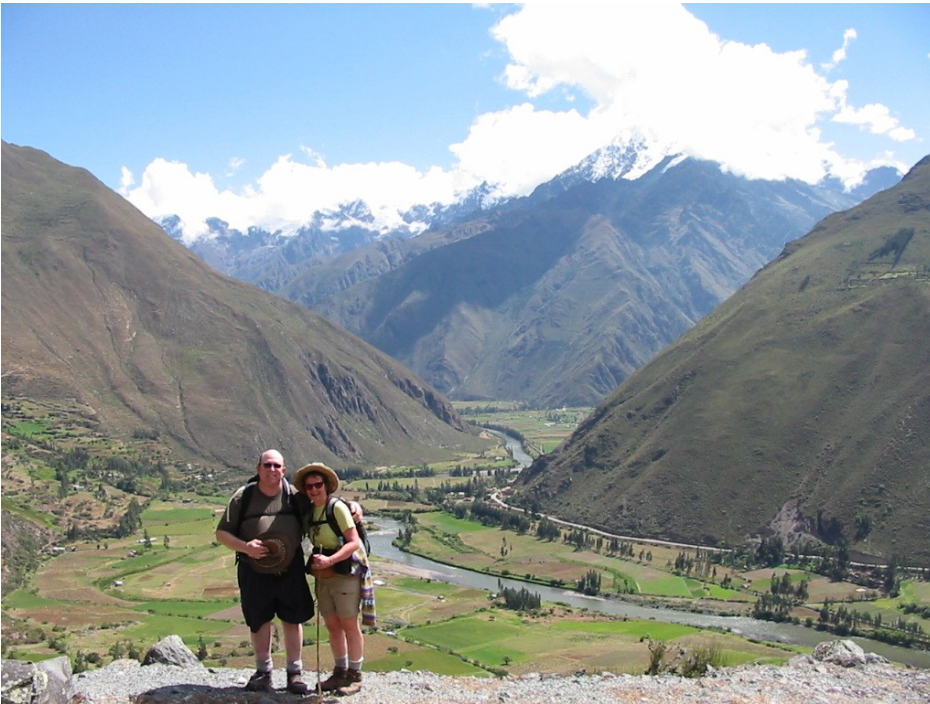
Beauty surrounds the Inca Trail.

THE NEWSLETTER OF THE GLEN FALLS-SARATOGA CHAPTER OF THE ADIRONDACK MOUNTAIN CLUB