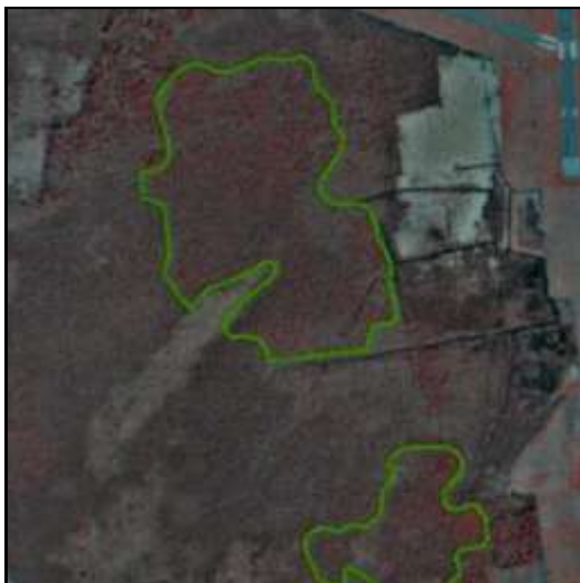
Map from NY Natural Heritage Program report showing location of northern white cedar swamp south and west of runways

The most recent threat to the wetland comes from the County's proposed extension of a runway at the airport, which could destroy many acres of wetlands depending on the final plan. In response to that potential threat, the Town of Queensbury recently proposed designating the 1.0 acre marl fen, which is in or near the path of the proposed runway extension, to be a Critical Environmental Area (CEA). This designation will help to ensure that any development proposal that may impact the marl fen receives a thorough environmental review.