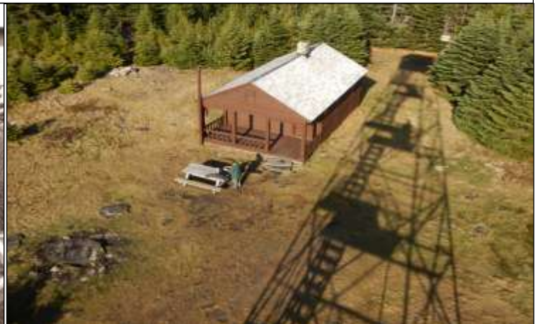
Hunter mountain fire tower shadow 2016.