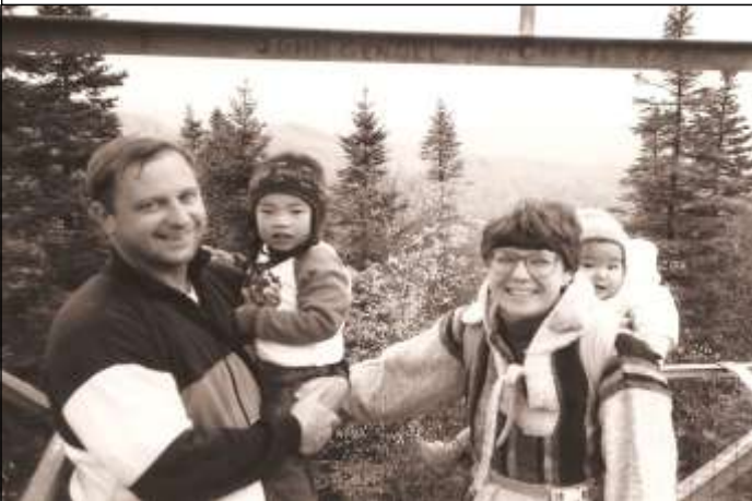
Goodnow mountain Fire Tower 1992