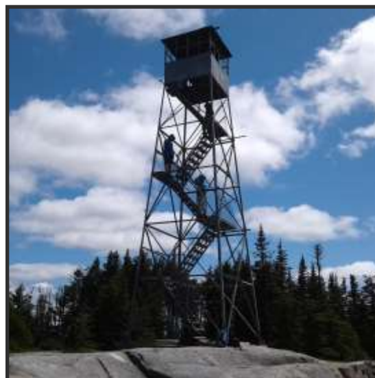
Blue Mountain Fire Tower—May 2019