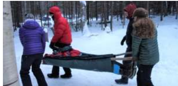
ADK Wilderness First Aid Training