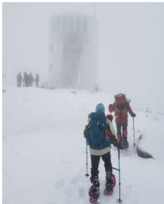
Whiteface Mountain