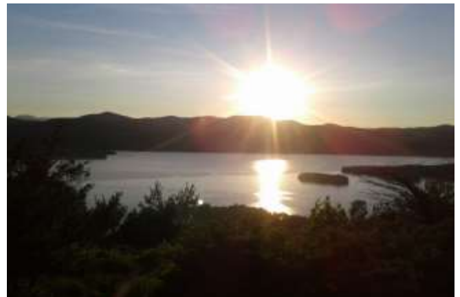
Sunset Shelving Rock 2019

Hiking solo now Dreaming of group hikes ahead Keeps my spirit bright