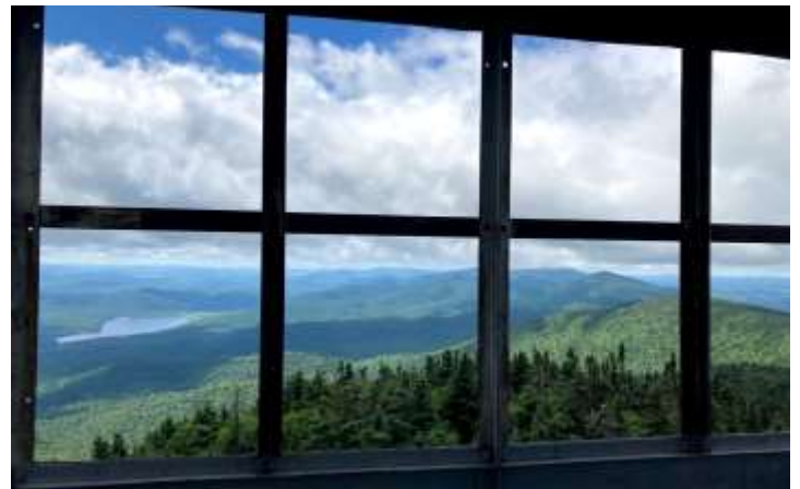
Snowy Mountain