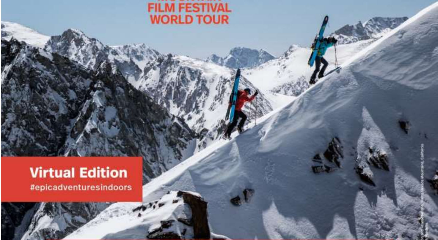
© 2020 Mountain Film Festival. All rights reserved. Photo: Steve Heston, Mountain Film Festival, California