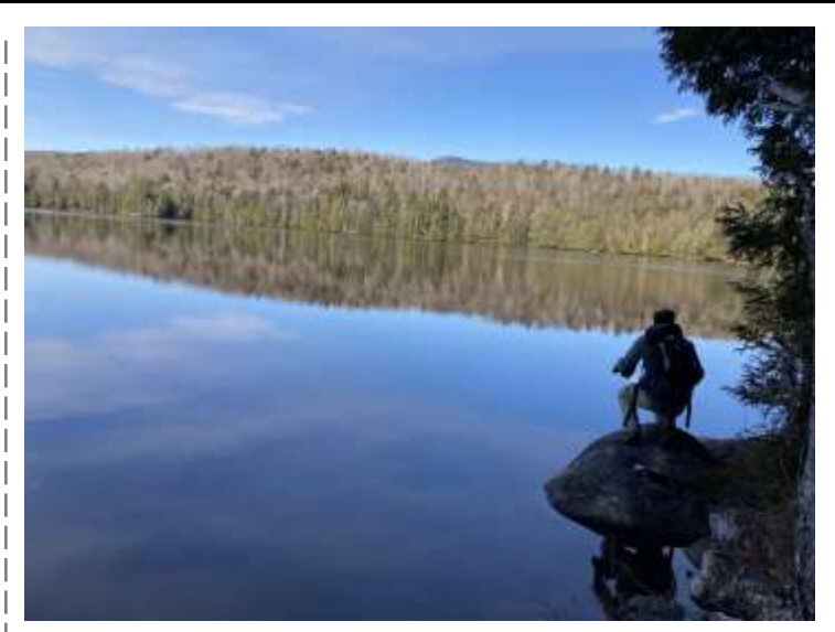
Reflections, photo by Jen Ferriss

nifer Ferriss - What a day! We were welcomed to a dusting of snow, a bit of ice, and frozen mud on the hike up Goodnow. After enjoying 360 degree views from the top platform of the Fire Tower and the traditional guessing game of what mountain is that?, we made our way back down to our cars by 10. Next stop, the Great Camp Santanonni. While checking out the farm we were happy to see our friends Salem and Karen walk up the road to join us for the rest of the walk into the Camp. We ended the day at Overlook Park in Newcomb thinking about our next adventure on the snow covered High Peaks. Birthday coleaders Jen F and Joe B were joined by Kimberly L, Anthony S and John A., with guest appearance by Salem and Karen P.