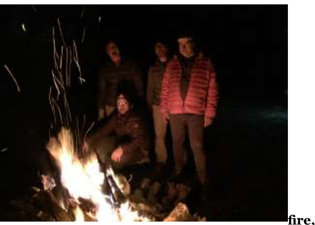
Camp photo by Jeff Mans

camp. As our day's efforts came to a close, a few of us decided to gaze at the night sky from the point on Watch Rock before calling it a night. In an electrifying and celestial display that had to be seen to be fully appreciated, the stars, planets and Milky Way illuminated the night. Perhaps the most treasured sight to behold was the reflection of the Big Dipper, and a few other constellations, twinkling from the calm waters just off the shore of Watch Rock, as though the stars were illuminating from beneath the waters. Truly unforgettable. After a chilly night and frosty morning, the dense lake fog enveloped our camp and slowly waxed and waned as the sun began to shine through the mist and make its indomitable presence known. We packed up and retraced our steps back to the outlet and over to another lakeshore lean-to where we dropped our gear and hiked along the east shore, across the bridge over the inlet of Pharaoh Lake Falls, and out towards Grizzle Ocean, before abandoning the last segment after realizing our overambitious plan to include Treadway in this trip. We found Pharaoh Lake to be a destination unto itself, with more first rate lean-tos and campsites along the shoreline. Great group and lots of fun. Participants: Jeff Mans and Jim Zwynenburg (co-leaders), Joe Babcock, Chris Lovett and John Acacia.