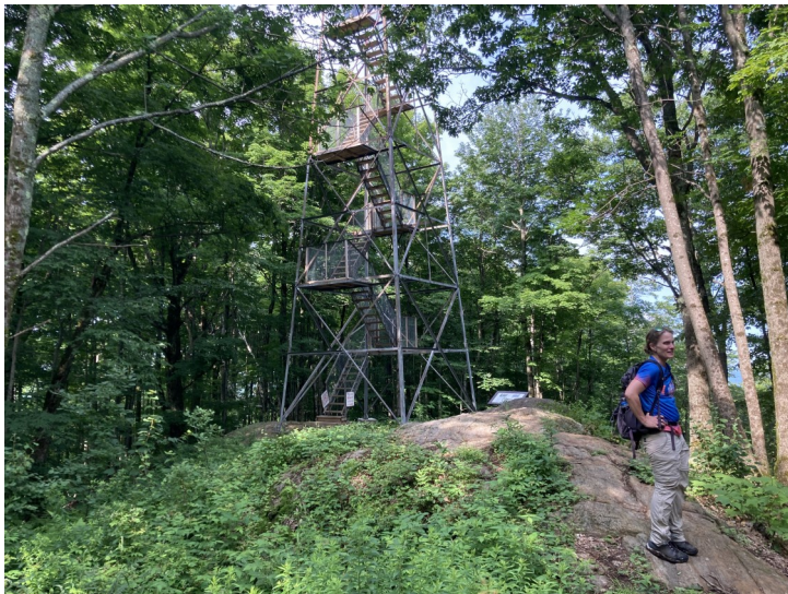
Swede Fire Tower