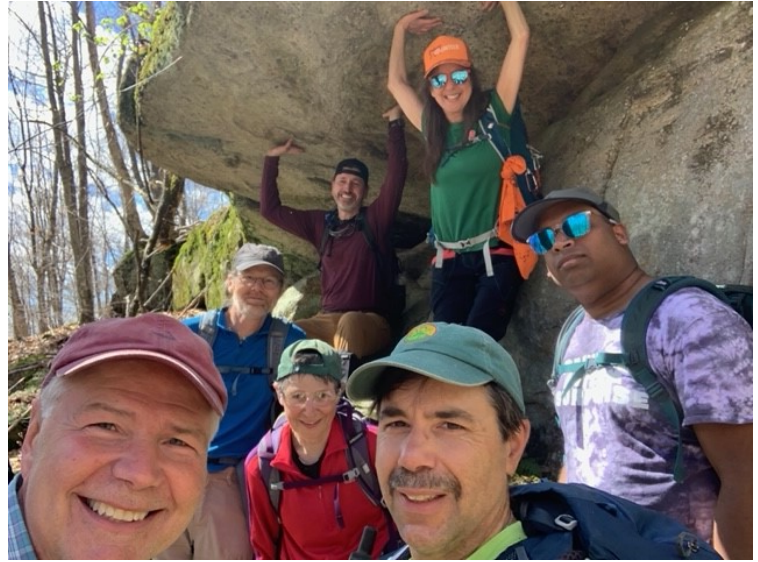
Washburn Ridge Bushwack