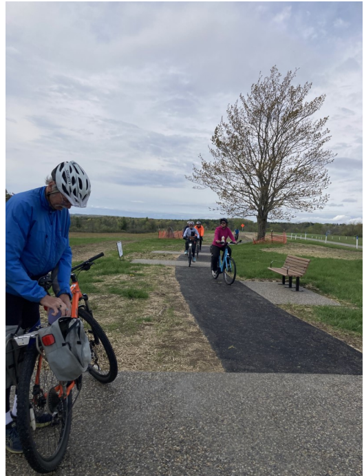
Cycling @ The Battlefield