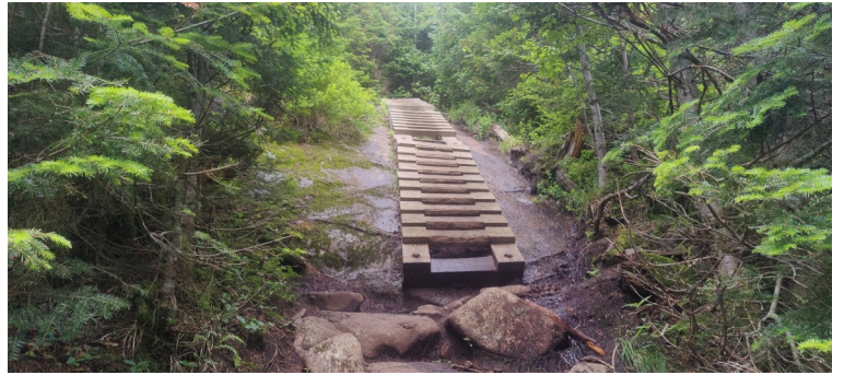
Adirondack Ladder